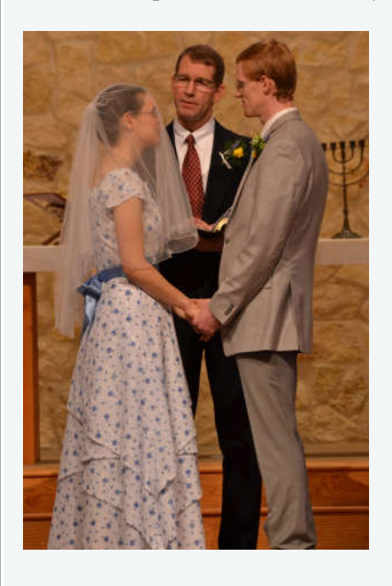
Repeating vows to each other

November 14, 2015 was a very joyful day for both of us. On this special day, we vowed before the Lord and before many of our dear friends and family members that we will love each other and stay faithful to one another "until death do us part." Those were very solemn vows, which we do not take lightly.