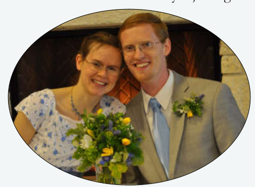
Friends and family rejoicing with us

Even though marriage is a very solemn and serious commitment, it is also very exciting and is a cause of much rejoicing. We were certainly rejoicing that day, and still are!