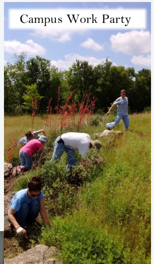
Campus Work Party