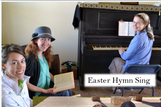
Easter Hymn Sing

There are so many facets of what it looks like to be part of this community, but instead of just listing them out in bullet points... how about some pictures? :)