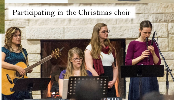
Participating in the Christmas choir