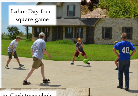
Labor Day four-square game