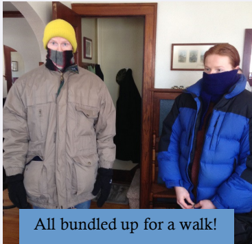
All bundled up for a walk!

Instead of heading south right after Christmas we travelled east to