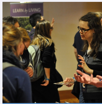
Talking to students

Indiana, where we met up with some other GFA staff to represent the ministry at a conference for college students. There were about 2,000 attendees, and we were there to share with them about the School of Discipleship program at GFA.