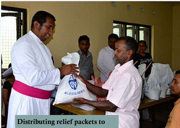
Distributing relief packets to flood victims in Sri Lanka

God, thousands of the survivors have been blessed by the ministry of GFA teams. One village representative shared, "The people in my area have never received such a comprehensive relief pack. This is a great blessing to all these families who lost everything in this devastating flood. I thank [the Church] on behalf of the community for bringing all this aid to our doorstep and distributing to the needy families." What a beautiful testimony of God's mercy!