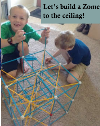
Let's build a Zome tower to the ceiling!