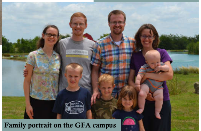
Family portrait on the GFA campus

We are grateful to each one of you for your love, prayers, and support. If it weren't for y'all, we couldn't be here doing what we are doing! If you would ever like to come visit, please do let us know - we love to have guests and would be excited for the opportunity to share more personally with you about what your life is involved in as you partner with us in this work. We are constantly amazed at the reports we receive from the field that share about what God is doing to build His kingdom, and it reminds us what a privilege we have to be involved in His work.