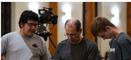
SD students join GFA staff at all our prayer meetings