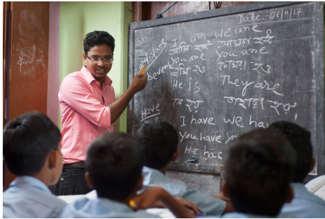
Bridge of Hope staff make a huge difference for the children and their families