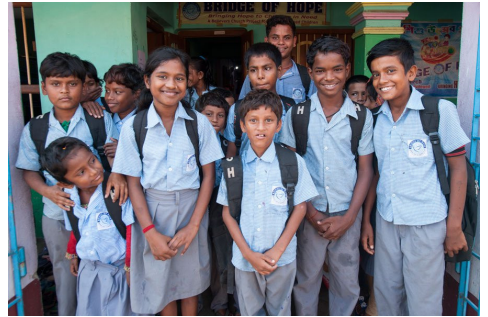
Thanks to BOH, these kids have the opportunity to hope and dream!