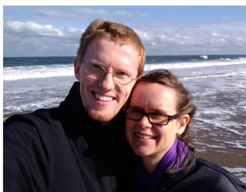
Left: R&R at the Atlantic Ocean