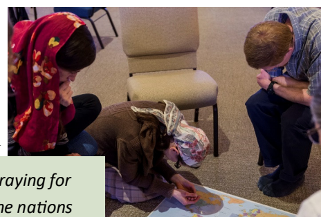
Praying for the nations

Also in April, we as the staff body engaged in a day of fasting and prayer. In light of some of the challenges we're facing in