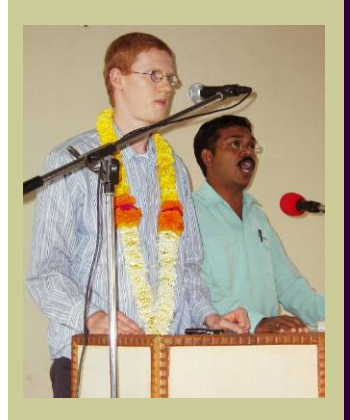
Sharing my testimony, with a translator

Do you not say, 'There are still four months and then comes the harvest'? Behold, I say to you, lift up your eyes and look at the fields, for they are already white for harvest! (John 4:35)