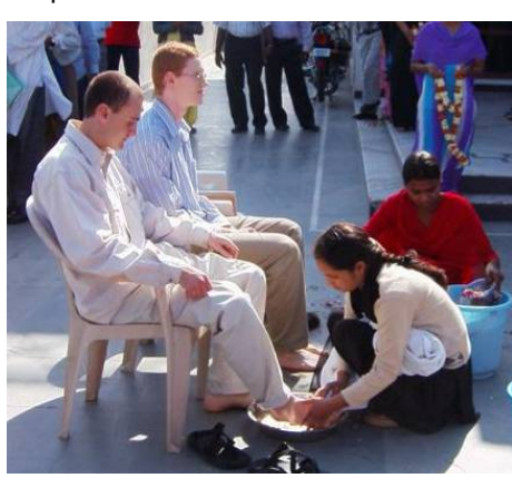
We were honored and welcomed in a variety of ways

Our team visited four of GFA's regional offices in India. We spent quality time with the staff and top leaders of Gospel for Asia, visited churches and Bible colleges and Bridge of Hope schools, and much more.