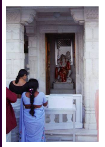
Hindus worshipping an idol in one of their temples