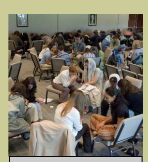
Much of our work is done with our heads bowed