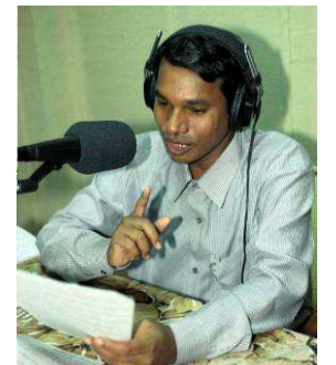
GFA broadcasts the Gospel in 103 languages

Internship activities include camping, service projects, and getting a little too close to nature