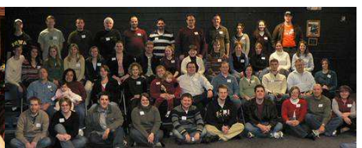
Reunion of the Senior High Youth Group back home (Dec 26) — I haven't seen them in years!