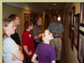
My family visited me at GFA in July. Here they're getting a building tour.