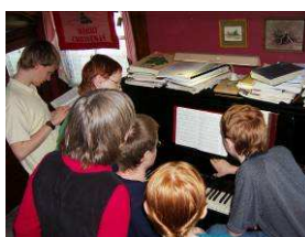
My family singing hymns together on Christmas

My dad and I are reading and discussing With Christ in the School of Prayer by Andrew Murray. In Chapter 1, he says: "He will breathe His own life, which is all prayer, into us. As He makes us partakers of His righteousness and His life, He will make us partakers of His intercession, too."