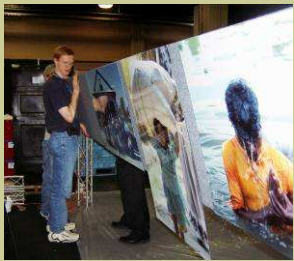
Below: Helping set up the booth and telling people about GFA at the NRB convention