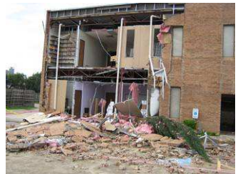
Above: Tornado damage here in Carrollton, TX

This week, five tornados came through here, at about 3:30 in the morning. I had never heard wind so loud before, and I was a little frightened. I was praying that GFA wouldn't be destroyed! The next morning I drove around the neighborhood and saw several trees and fences knocked down. Elsewhere in Carrollton, power poles were snapped and roofs ripped off houses. At my house, we just lost a few shingles and tree branches. The Lord was very merciful; it could have been far worse.