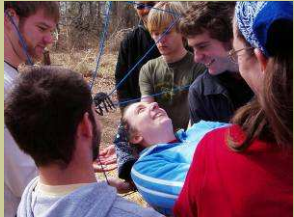
Above: Interns doing a team-building activity