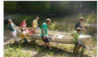
Above: We went camping with a couple GFA families in October