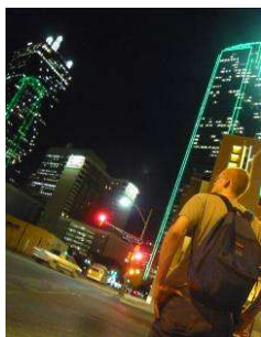
Above: Witnessing on the streets in Dallas

“To train young people to be devout followers of Christ and to live their lives in light of the Great Commission both during their time of service at Gospel for Asia and in the rest of their lives.”