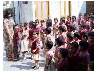
Above: I visited this BOH center in India three years ago