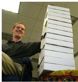
Top: Five Minutes for Asia box contents