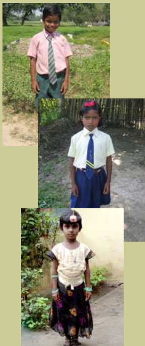
Above: These three children in our Bridge of Hope program are among many needing sponsors who are featured on www.gfa.org .