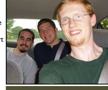
calling them to return on staff at GFA!