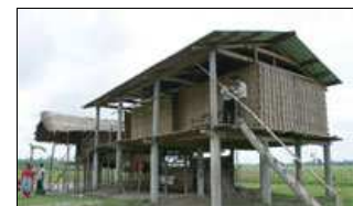
GFA is working hard to rebuild homes for persecuted Christians in Orissa