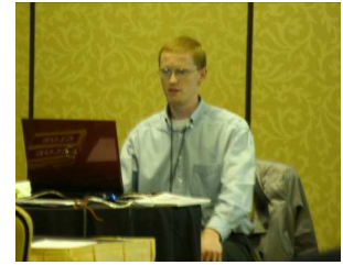
I shared for a few minutes during the session on "Segmentation" to highlight the "SQL Override" feature

Some of the conference sessions gave me more in-depth insight into areas of DonorStudio that I have been working with, and other sessions gave me a bigger picture of the product as a whole. I was asked to share for 6 minutes during one of the break-out sessions, on "Segmentation," to highlight how we have been using one of