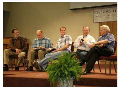
Above: I had a wonderful time making new friends, sharing about GFA, and listening to great teaching at the Fellowship Conference my church attended in April