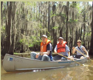
Above: I went camping and canoeing with some friends at Caddo Lake State Park