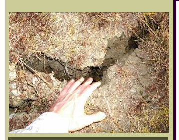
Above : We are praying for rain.

Do you not say, 'There are still four months and then comes the harvest'? Behold, I say to you, lift up your eyes and look at the fields, for they are already white for harvest! (John 4:35)