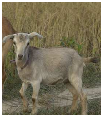
Enemies of the gospel used a stolen goat as a reason to oppress the Christians — but God turned it around for good