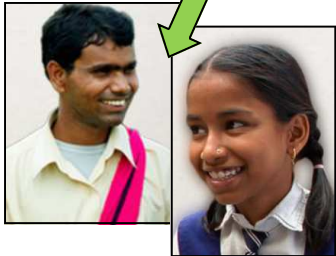
The work I do in IT helps missionaries and children be sponsored