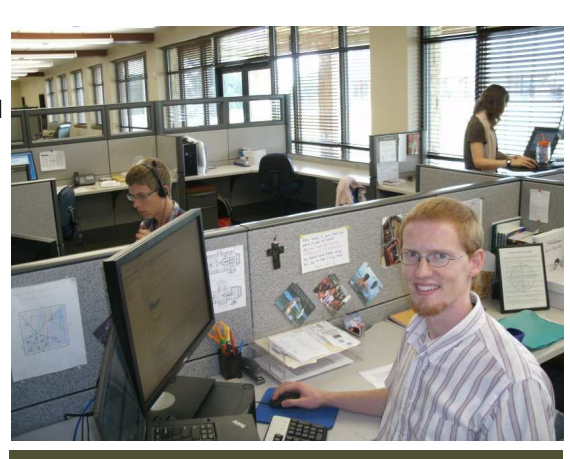
Above: At work in the new admin building.

cut ruts in the bare dirt left from construction. The blankets help prevent further erosion and provide ideal conditions for grass to grow up.