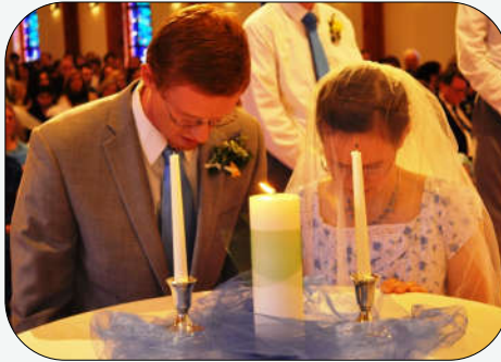
Prayer after lighting the Unity Candle

Prayer is important to both of us as we seek to please the Lord and walk in a manner worthy of His Gospel.