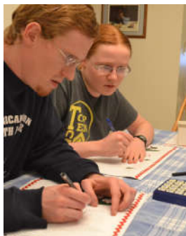
← Boggle at a friend's house

And now we are back home in Wills Point, after 8 weeks full of a flurry of activities. It's good to be settling in and starting to work out a rhythm. We still have boxes of stuff to sort through and decisions to make about various aspects of combining our lives, but we are grateful to the Lord for giving us each other and are excited to get to serve Him together!