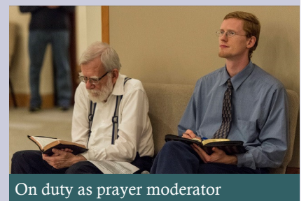
On duty as prayer moderator

We do take your prayers seriously. Please keep us and the ministry in prayer, and let us know how we can be praying for you. Thank you so much.