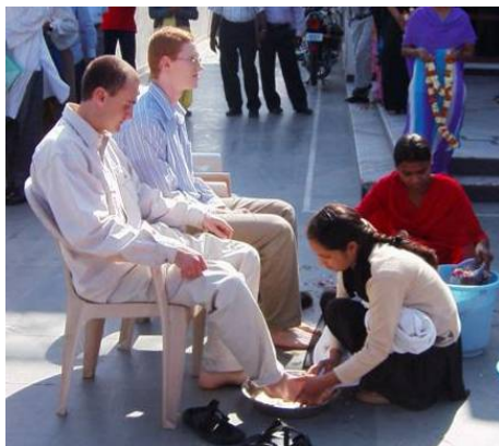
We were honored and welcomed in a variety of ways

Our team visited four of GFA's regional offices in India. We spent quality time with the staff and top leaders of Gospel for Asia, visited churches and Bible colleges and Bridge of Hope schools, and much more.