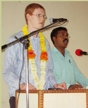
Sharing my testimony, with a translator

Do you not say, 'There are still four months and then comes the harvest'? Behold, I say to you, lift up your eyes and look at the fields, for they are already white for harvest! (John 4:35)