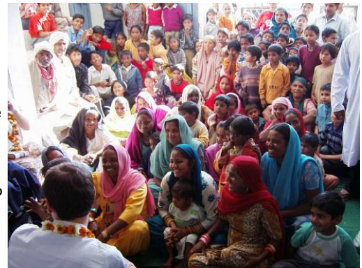
We visited this church in North India

crammed between two buildings (there is no church building). The pastor's wife is leading worship while holding their baby in her arms. Heartfelt love and joy are written on the believers' faces as they sing—I can tell Jesus means a lot to them. On top of a house across the street, five curious neighborhood kids are watching the service.