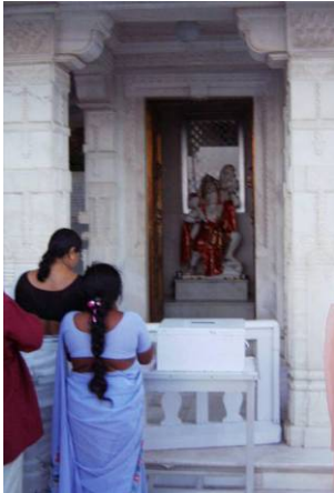
Hindus worshipping an idol in one of their temples