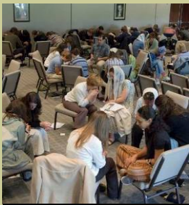
Much of our work is done with our heads bowed