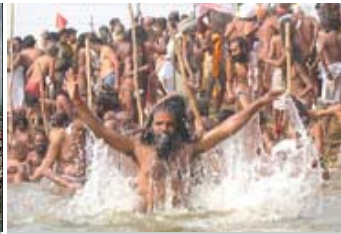
Hindus come from all over to wash away their sins in the Ganges river

out will be taken back to these villages and read by many."