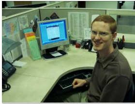
In the Call Center, I get to speak with hundreds of GFA's faithful supporters