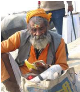
This man, sincerely seeking truth at the Ardh Kumbh festival, is now hearing of God's love through Christ

GFA. For example, if someone donates for GFA radio, I tell them a recent report about a Hindu man who became paralyzed and began crying out to all the gods he knew, but to no avail. Then he heard about Jesus for the first time on one of GFA's radio broadcasts, cried out to Him, and was miraculously healed! In response, the man and his family gave their lives to the Lord.