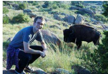
Internship activities include camping, service projects, and getting a little too close to nature