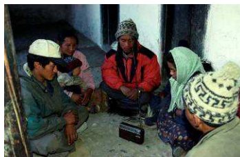
GFA Radio receives 1 million listener responses a year