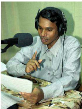
GFA broadcasts the Gospel in 103 languages