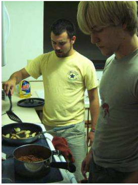
Household activities include cooking (above), Bible study, and posing for photos (below)