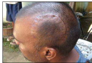
This national missionary was attacked because of his fruitful Christian witness

In October, massive flooding in the states of Karnataka and Andhra Pradesh, India, left 10 million homeless; 170 GFA-related churches were destroyed or damaged. GFA responded by providing relief supplies to over 10,000