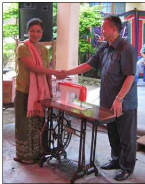
GFA-supported missionaries gave out thousands of Christmas gifts to help the poor in Asia

I constantly get asked, "How is your mom doing?" Thank you for praying, and for asking. Mom has been feeling good for the most part, though the chemo treatments wear her down some. She has gone through 8 out of 12 rounds of chemo. She has also been teaching five classes at a Christian school. It was a real blessing for me to get to visit home in October and December and spend time with my mom and the whole family. Please keep praying for God to do a miracle and heal her completely.