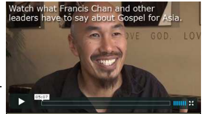
Watch the 5-minute Speaker Video at www.gfa.org/church to see why so many churches have been deeply impacted through GFA's message.