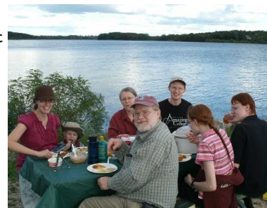
Enjoying a picnic with my family in Iowa